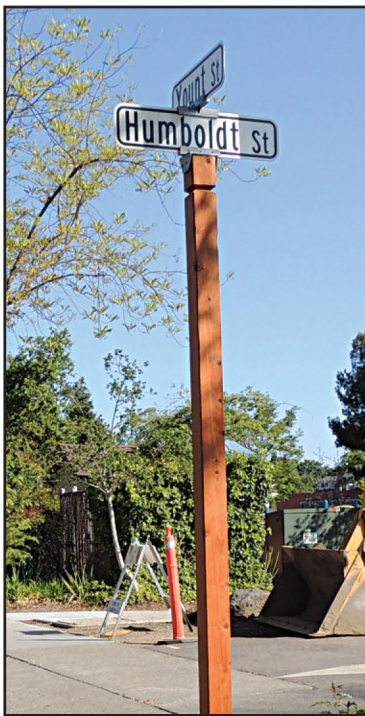
Sign Option A/C