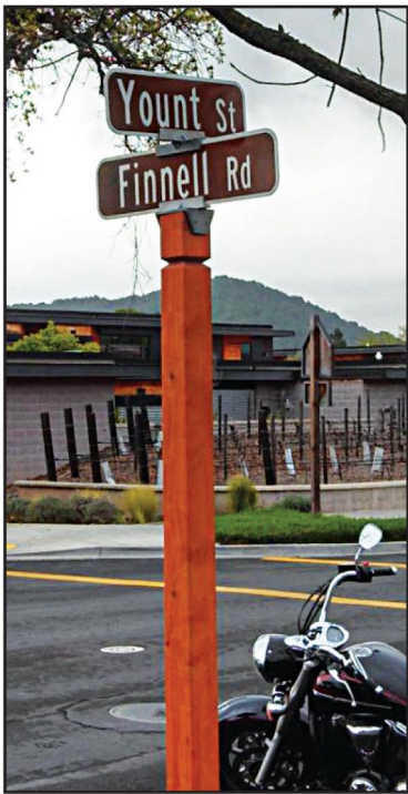
Sign Option A/A