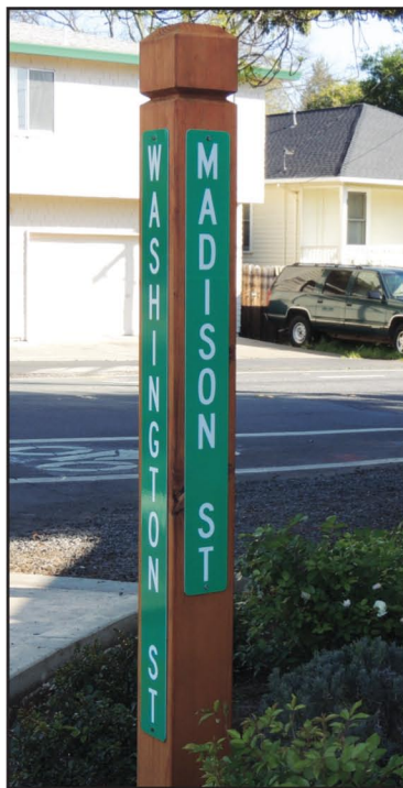
Sign Option B/B