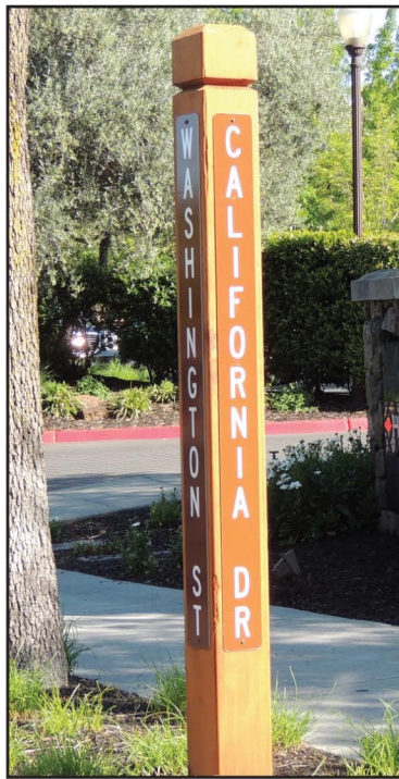
Sign Option B/A