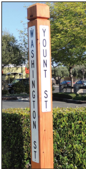
Sign Option B/C

The 60-day demonstration period is set to end on May 30.