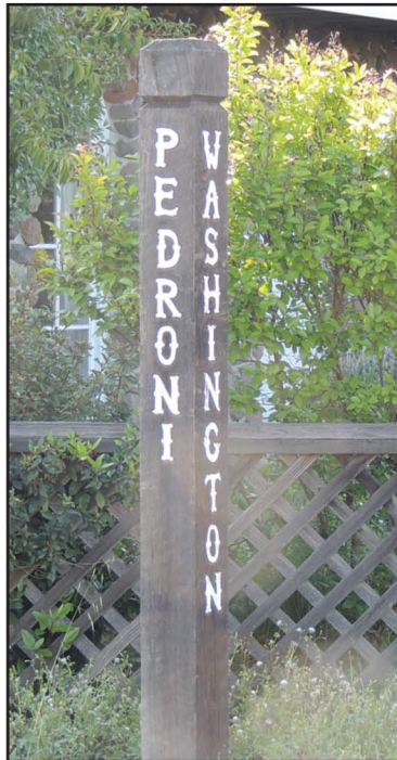
Sign Option C/Status Quo