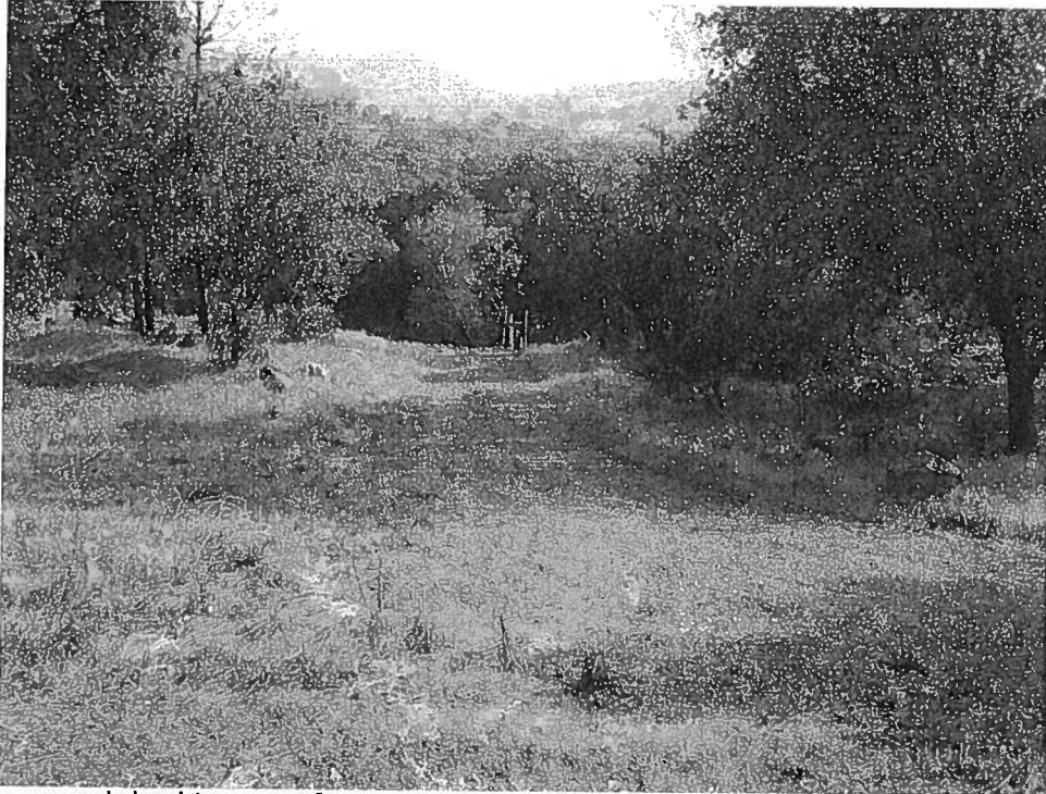
Photograph looking east from new driveway connection at Soda Canyon Road. This stretch of driveway will be improved to full Road and Street Standards