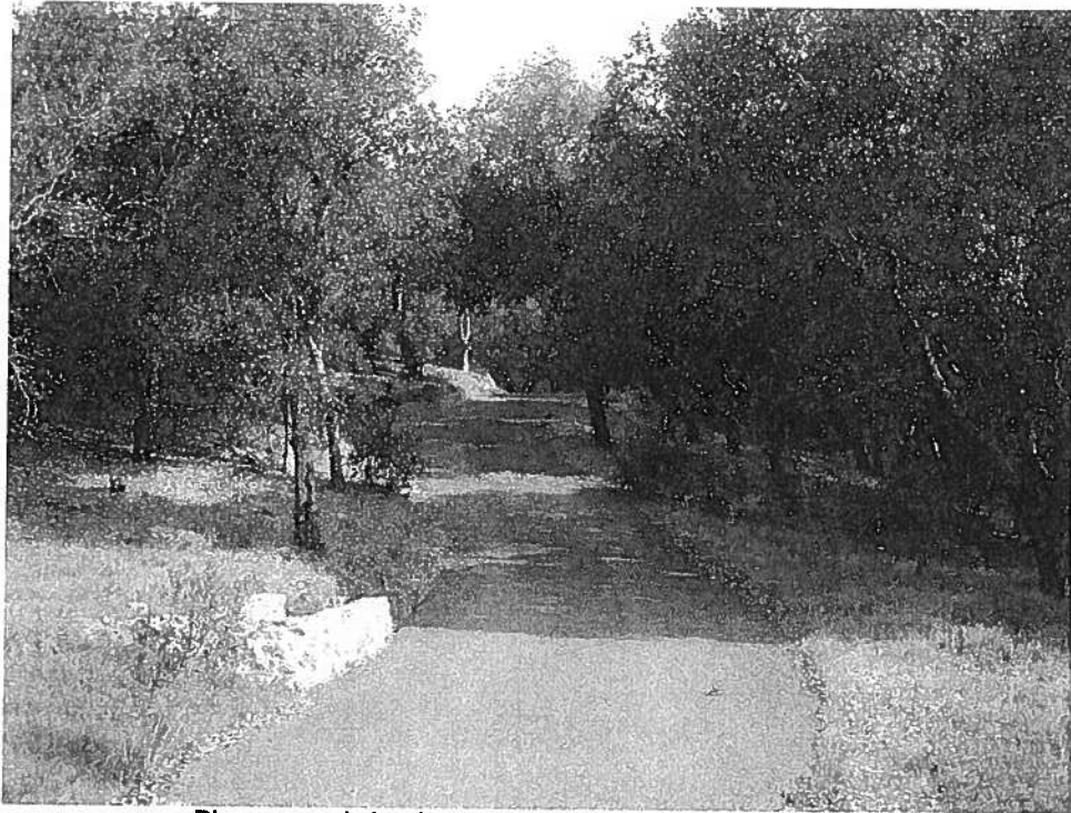
Photograph looking northeast from STA 15+00 This stretch of driveway will be improved to full Road and Street Standards