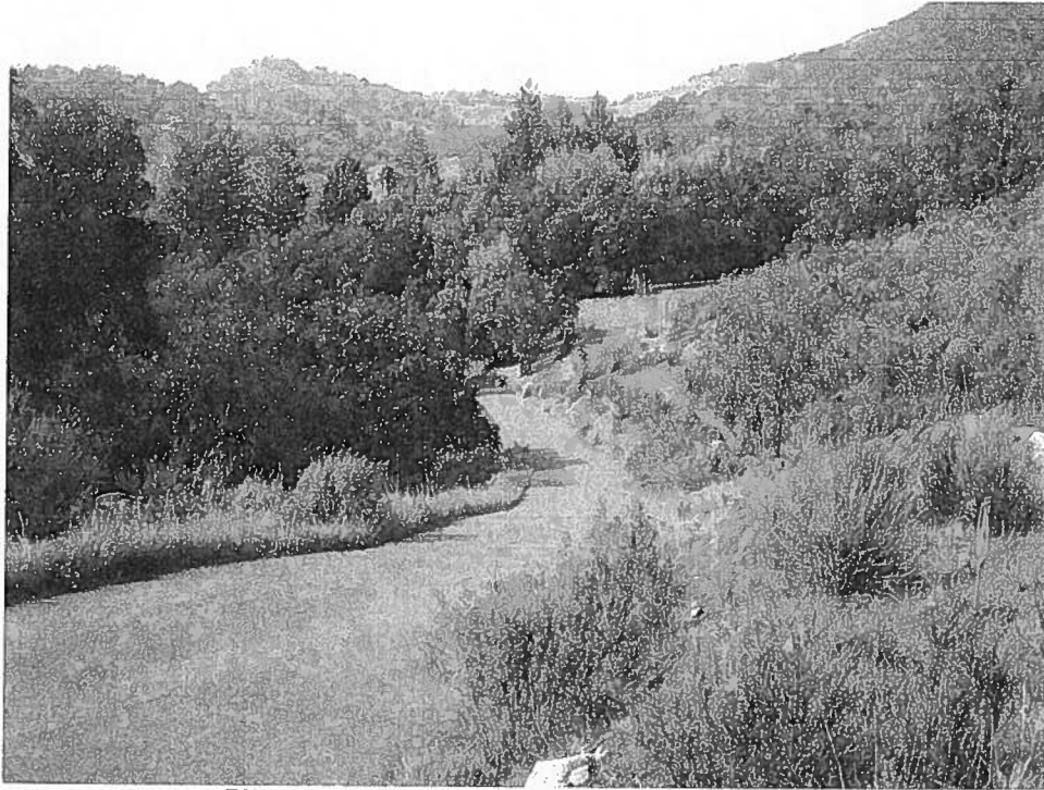
Photograph looking west from STA 21+00

This stretch of driveway will be improved to 14 feet wide to provide adequate access and to minimize grading on steep slopes, minimize disturbance to rock outcrops and to minimize impacts to trees and the watercourse at the base of the hill on left. Area with slopes in excess of 20% will be reduced to 20% or less.