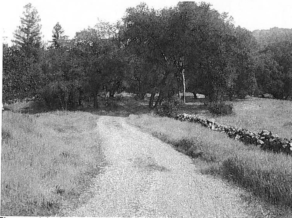
Photograph looking north along existing driveway alignment at STA 12+00 New driveway will transition to 14 feet wide at the trees point to minimize tree removal