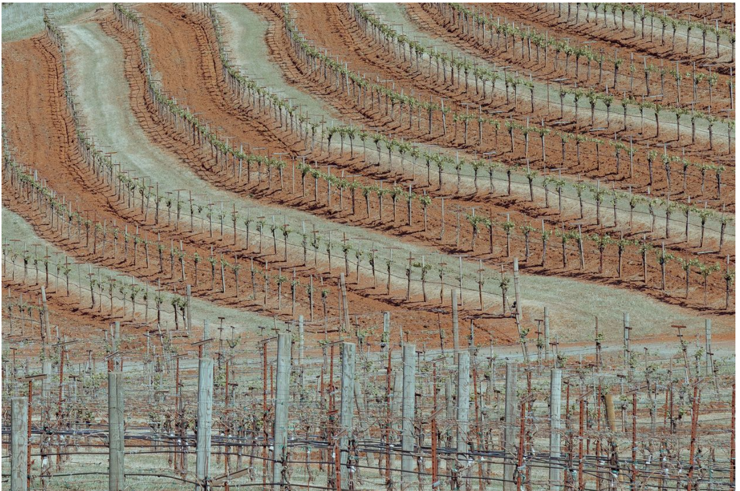
Smith-Madrone Vineyards & Winery in St. Helena, Calif.